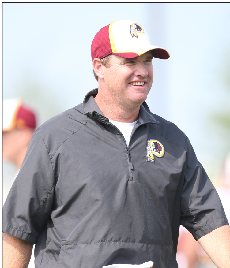
Jay Gruden, 46 at the time of his hiring, became the youngest head coach hired by the Redskins on a non-interim basis since the team hired 40-year-old Joe Gibbs in 1981.